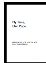
My Time, Our Place; Framework for School Age Care in Australia

Critical reflection: Reflective practices that focus on implications for equity and social justice ( Early Years Learning Framework – refer to Sources ).